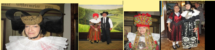
Schaumburg Trachten:Bueckeberg,Carpenter,Bridal Hat,Lindhorst Tracht