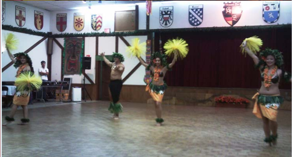
Luau - 2014