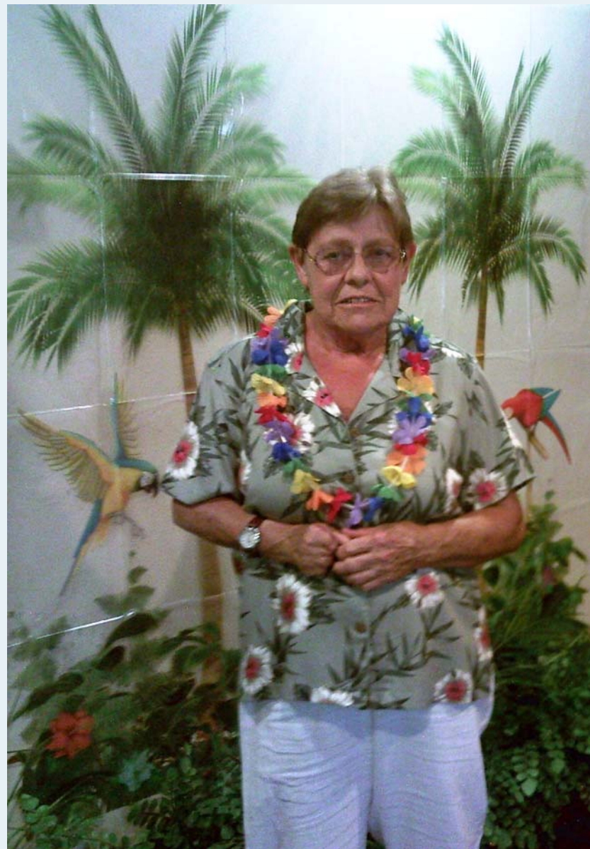
Luau - 2014