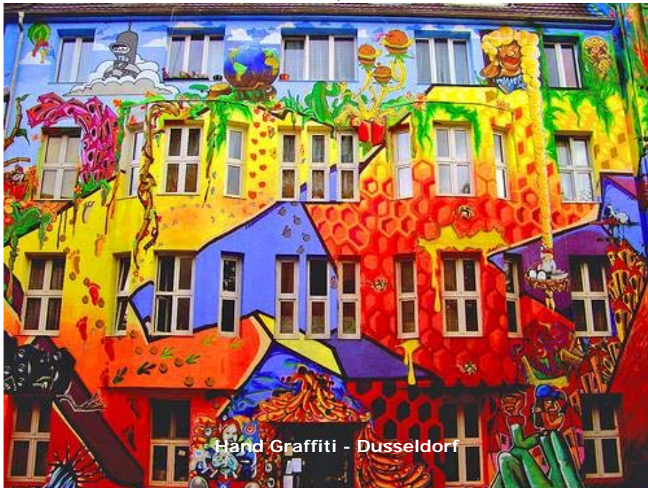
Hand Graffiti - Dusseldorf