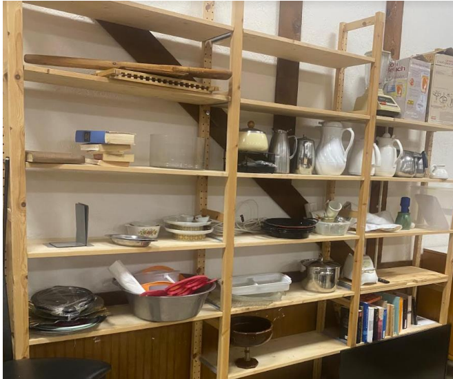
After cleaning out the kitchen and the club there are a lot of "freebies" available. Help yourself next time you're at the club!