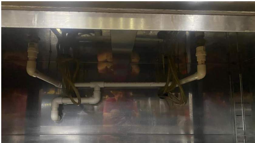
The Beer taps are now connected to the drain system, and we don't have to rely on beer pitchers to catch the drips!