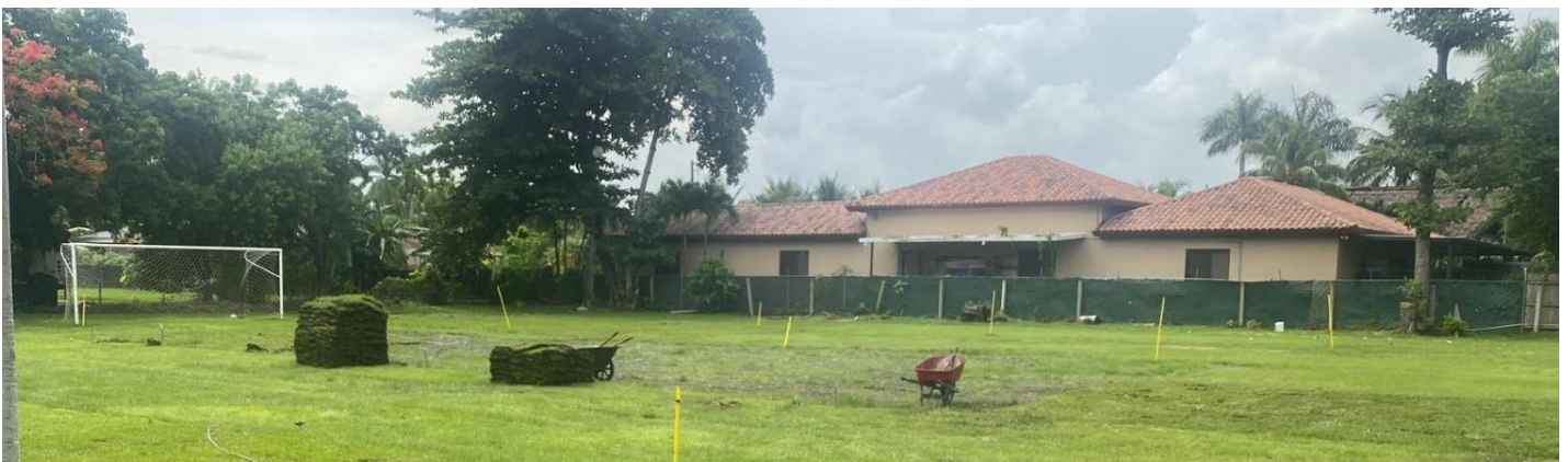
The Soccer teams have invested hundreds of man hours working on the field this summer. By the time you get this newsletter, all the sod will have been laid and the field will be ready for the coming season.