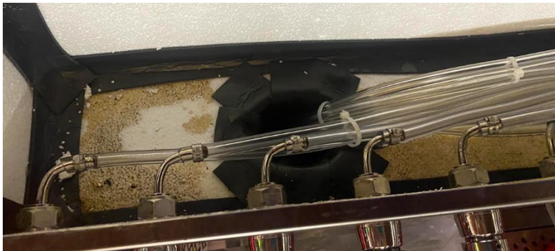
To make it easier to change kegs, and to know which hose goes to which keg, the hoses are all numbered 1-12 from left to right! This picture was taken inside of the tower.