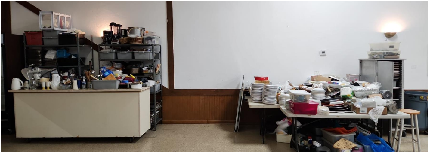
The kitchen had to be emptied. The club was given two big shelving units which we will be using elsewhere once the kitchen is put back together. And one of the kitchen storage units will be moved to the back of the house.

WHILE THE CLUB WAS CLOSED DURING JULY, A LOT OF WORK WAS ACCOMPLISHED.