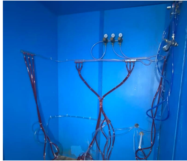
The inside of the beer cooler is now...BLUE?! It surprised us too, but instead of the plywood that was there we now have nice insulated, metal on the sides and ceiling. And new hoses. (Anyone want to use white duct tape to make stripes?)