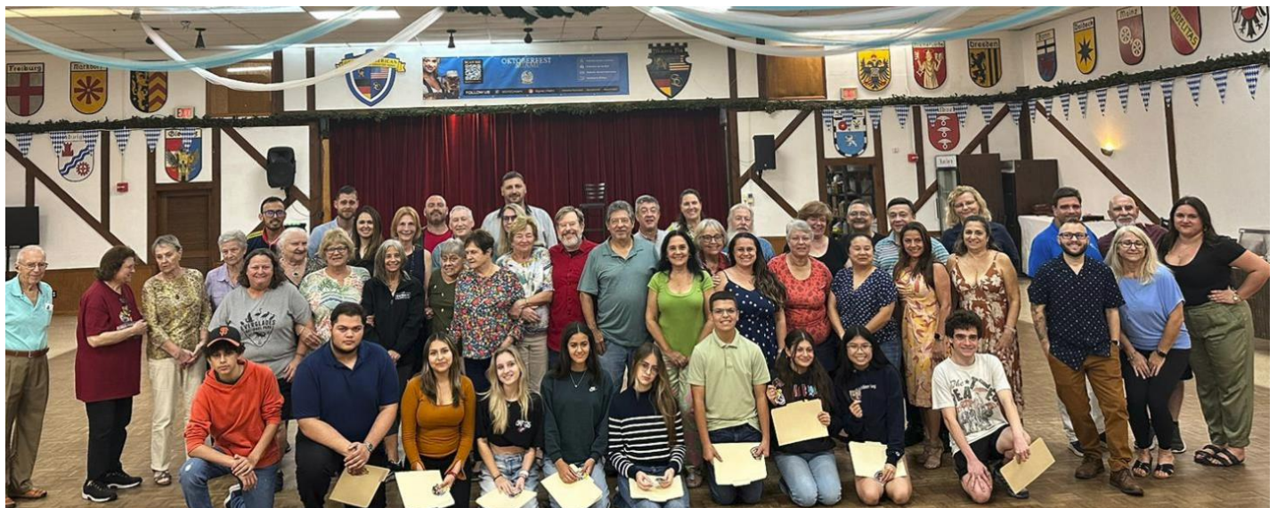
Oktoberfest Volunteer Thank-You Dinner