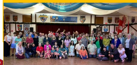
Oktoberfest Volunteer Thank You Dinner