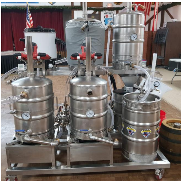
The January class will be on how to make a doppel bock.